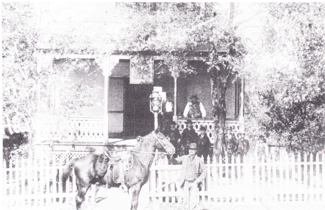
Augusta Wine Company Hall, c. 1870.

The following year the Wine Company built a brick wine hall, with a 2-story deep wine cellar and 1000-gallon barrels. 46 The bricks reportedly were made at a kiln on the Town Square across the street. The Wine Hall was described as a "saloon on